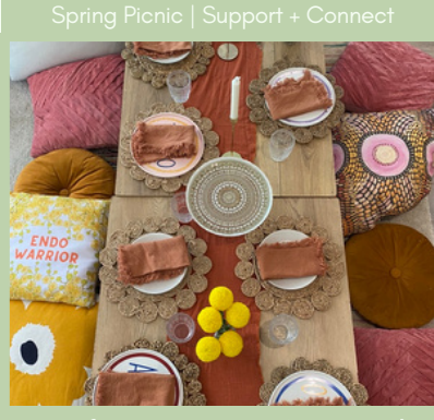
Our first ever event in Nov 2022! A gorgeous indoor picnic.